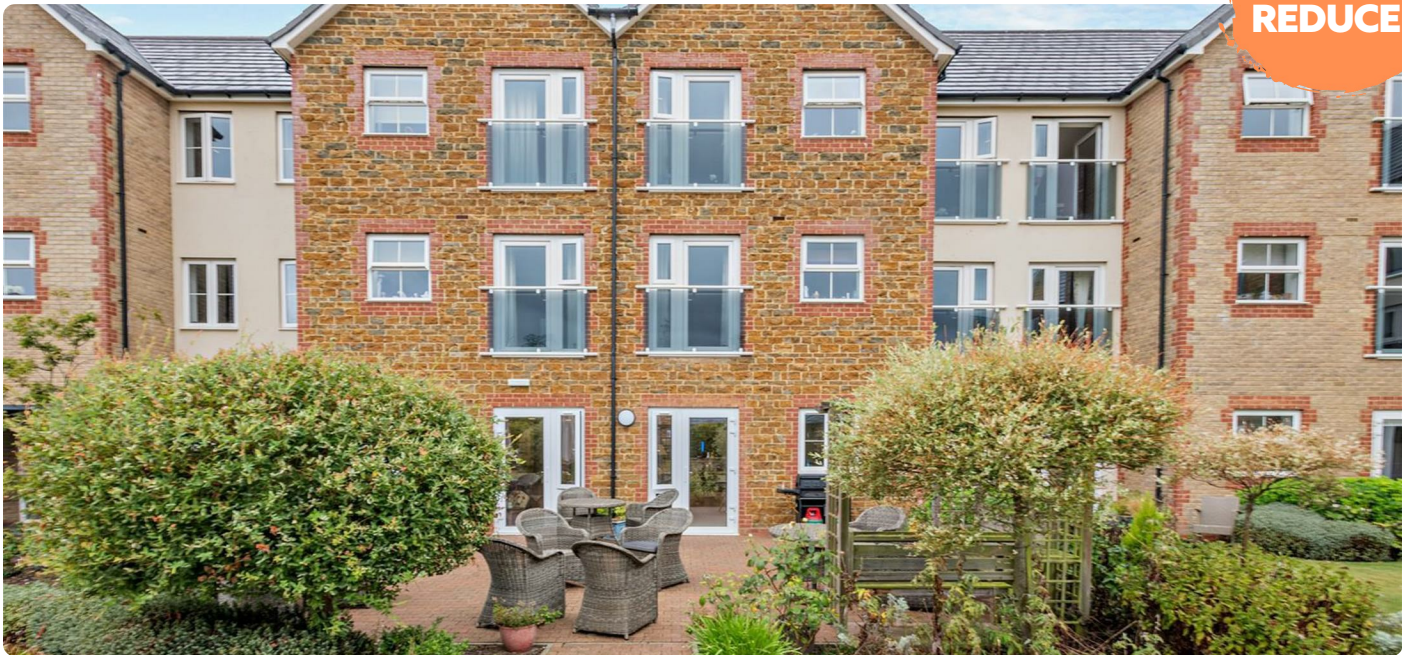
Eastland Grange, Flat, Valentine Road, Hunstanton, Norfolk Approximate Gross Internal Area 630 Sq Ft/59 Sq M